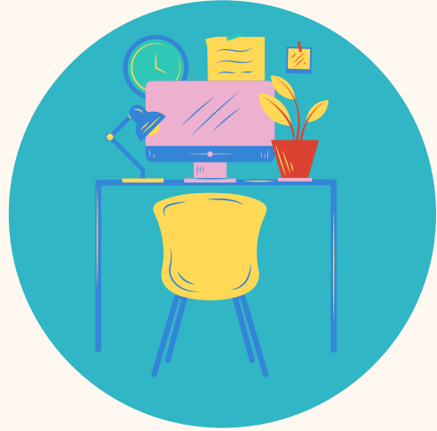
Study Table & Chair