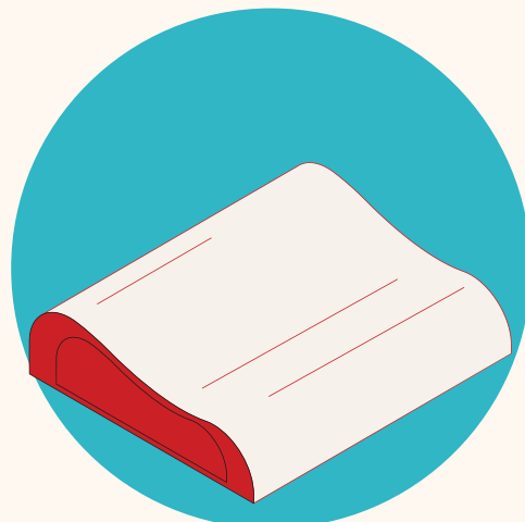
Pillow & Mattress