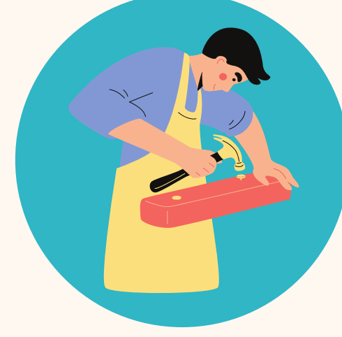
Simple handyman service